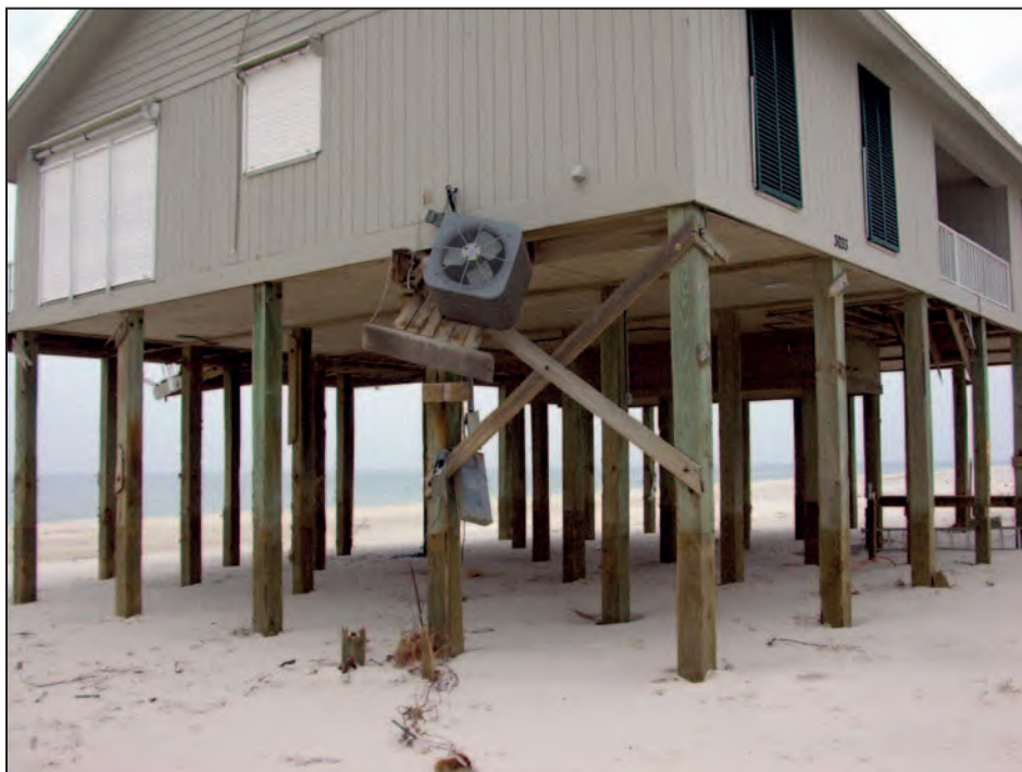
Figure 12-3. Small piles supporting a platform broken by floodborne debris

Although the 2012 IBC and 2012 IRC specify that flood damage-resistant materials be used below the BFE, in this Manual, flood damage-resistant materials are recommended below the DFE.