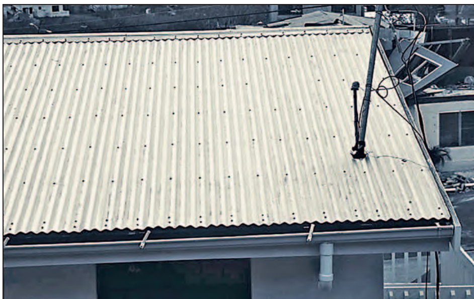
Figure 12-6. Damage caused by dropped overhead service, Hurricane Marilyn (U.S. Virgin Islands, 1995)