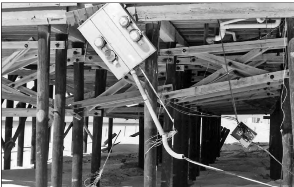
Figure 12-4. Electric service meters and feeders that were destroyed by floodwaters during Hurricane Opal (1995)

that produce 4 feet of flooding can cause water to enter the meter socket and disrupt the electric service. When a meter is below the flood level, electric service can be exposed to floodborne debris, wave action, and flood forces. Figure 12-5 shows an electric meter that is easily accessible by the utility company but is above the DFE.